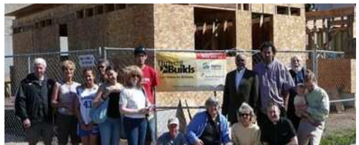
Habitat and Thrivent volunteers at the kick off ceremony.

Humanity. This is a $100 million commitment to work in partnership with Habitat for Humanity in building 10-15 homes in Thrivent's 31 regions around the United States. Habitat for Humanity -Trenton Area was very proud to be selected as one of the affiliates to work with Thrivent in this project. Trenton Habitat and Thrivent held their official kick off on June 10, 2006 at 637 North Clinton Avenue. Partner families,