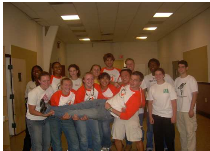
Princeton Students in East Trenton Community Center

The Princeton Community Action group of Princeton University sent a group of 15 students to live, work and sleep at Habitat for Humanity – Trenton Area's East Trenton Center. 11 of the students