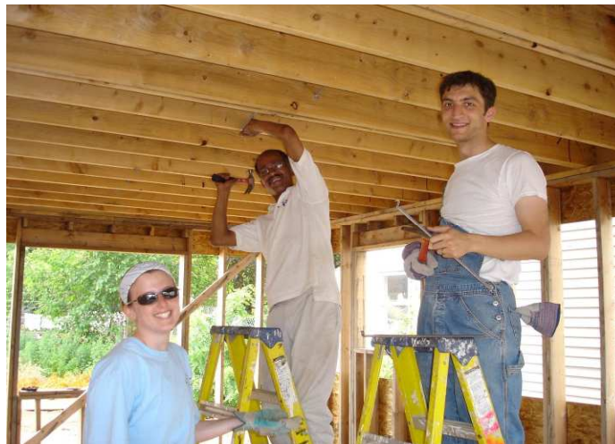
Members from a Hillier Architecture Team Build .

Many organizations, corporations, groups, friends, and families are taking advantage of our Habitat for Humanity - Trenton Area's Volunteer Programs to make the Habitat dream a reality. All of our programs are simple, effective, and fun! Many businesses choose to