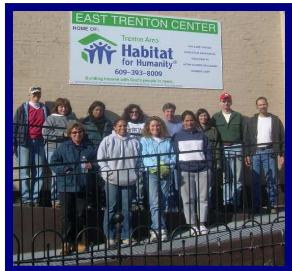
Members of a Merrill Lynch Team Build stop after a lunchtime meal to take a picture under the East Trenton Center sign in November 2006.

Contact the Volunteer Coordinator at 609-393-8009 ext. 228 for more information, and to schedule an orientation or to discuss our Team Building Program.