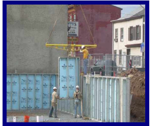
Basement walls are placed into the newly poured foundations on North Clinton Ave.

The formerly empty lot is already a bustling center of activity. The five foundations have been equipped with basement walls and volunteers are hard at work in the onset of the building process. We are very thankful that three of the row homes have attracted sponsors, but two are in need of committed support!