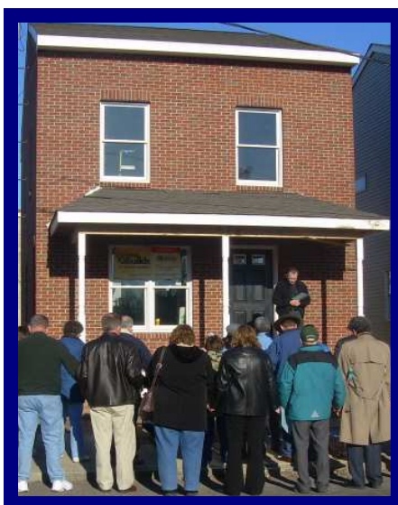
House Dedication participants extend into the street in front of the completed home on a beautiful morning in December 2006.

Holy Cross Lutheran Church Bordentown, NJ