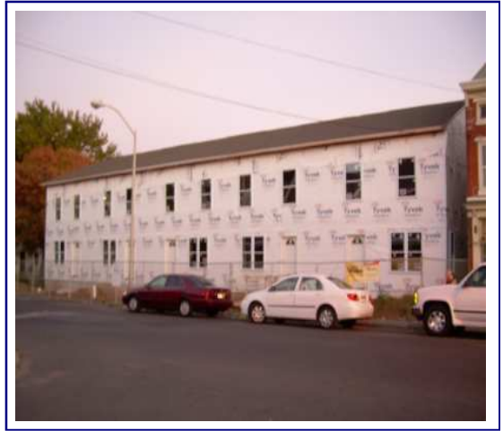
Pictured above is the current progress we have made on our five-home row house project.