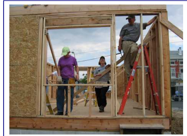
Pictured above are some of our hard working volunteers framing up some of the new homes that the Bovis Lend Lease golf outing will help to fund.

The event was a great success and an enjoyable outing for everyone in attendance.