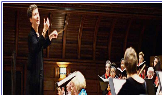
Pictured above is Princeton Pro Music practicing for a performance

Handel composed the Messiah at the request of three charities, and he gave the income from the work's premiere to the three