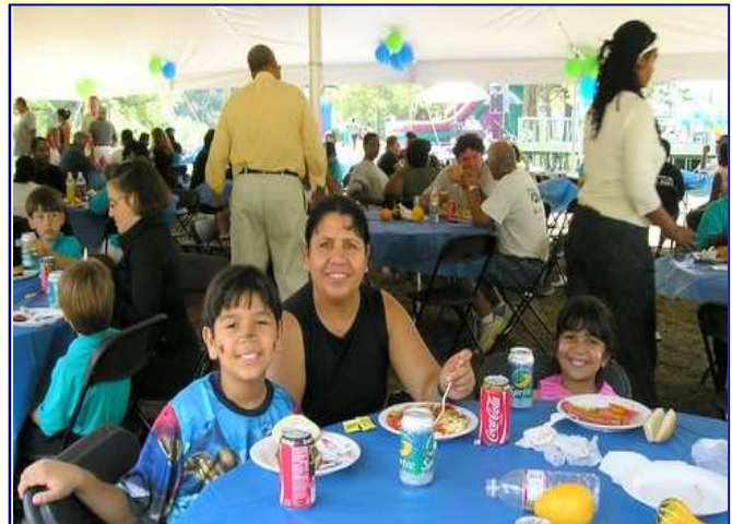
Everyone in attendance enjoyed food, music, dancing, and even face painting. Shown above is a family sitting down together for the delicious catered meal. To the left is the dance group TEDI posing for a group photo.

A row of decorated doors symbolized the different streets in Trenton on which Habitat has built more than 70 homes. They displayed pictures from all different builds over the past 20 years. There were pictures of partner families and volunteers working on homes as far back as the earliest build. Many photos displayed the connection that many of the volunteers and partner families had made in the building process.