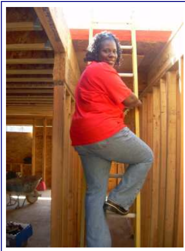
My family and I are very happy about our new home and we look forward to moving in for Christmas